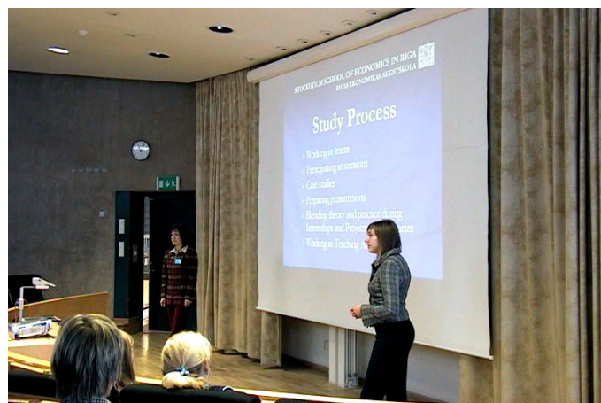
SSE Riga Ambassador informs about the study process.

from experienced students (the Ambassadors). There were also a number of visitors who had been travelled all the way from Estonia and Lithuania to